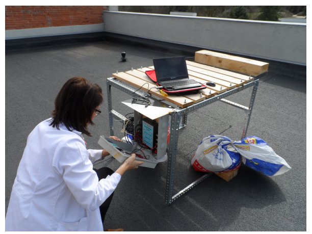
FIGURE 2. Trial set-up (Madrid).

at all against the sun or rainfall. All devices were arranged in a north-south direction (boards arranged in an east-west direction).